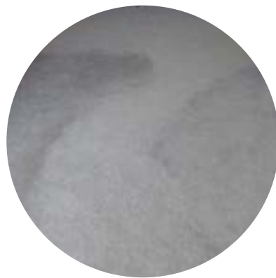
This is what a cut pile carpet can look like if shading occurs

Cut pile carpets, particularly plush pile carpets, may develop lighter or darker patches over time. Known as 'shading', 'puddling' or 'watermarking', it is caused by the permanent bending of the carpet pile fibres which then reflect the light differently. Brushing or shampooing does not reduce shading. The extent to which shading occurs cannot be accurately predicted or prevented. It does not affect the wear or durability of the carpet and is not recognised by Cavalier Bremworth as a manufacturing flaw or defect.